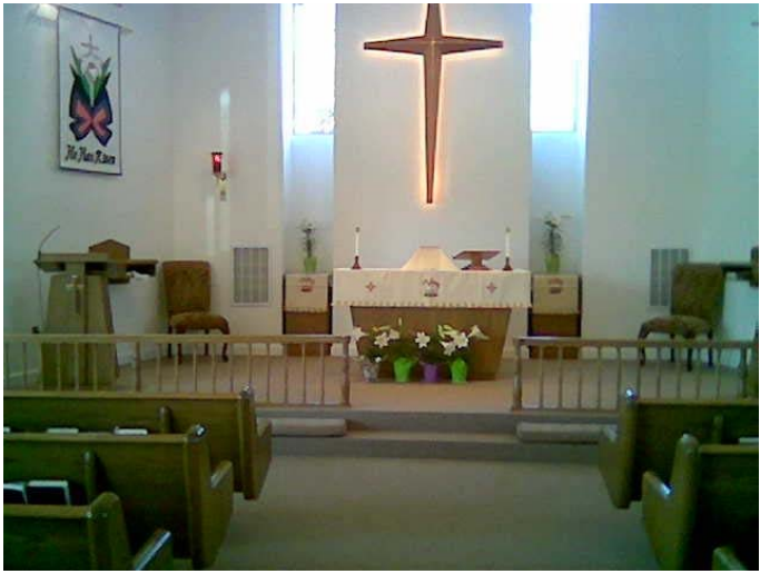
Church on Easter Sunday